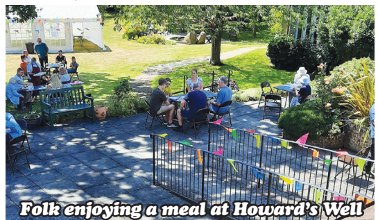
Folk enjoying a meal at Howard's Well

As with all who visit CCHC, the Lord continues His work and we rejoice that the end result will be more beautiful! He is the God who does all things well! (Mark 7:37) It has been a thrill welcoming resident guests back and we look forward to seeing more of you as our residential opportunities now begin to increase. As we venture forward, we are learning and discovering more than ever that this new season can empower our guests, building them up in their walk with the Lord.